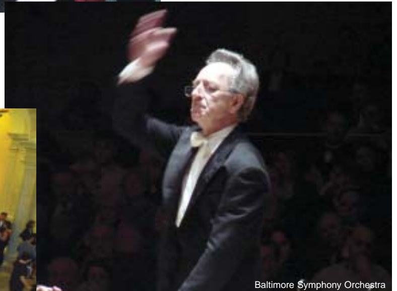
Baltimore Symphony Orchestra