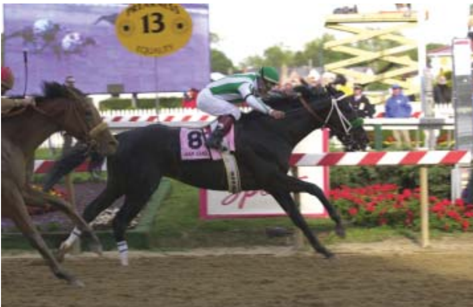
War Emblem heads for a win at the 127th Preakness Stakes.

A key component to selling a product—whether it is a widget or a state and its assets—is getting that product before the potential consumer. Maryland's participation in the annual Preakness celebrations offers an unparalleled opportu-