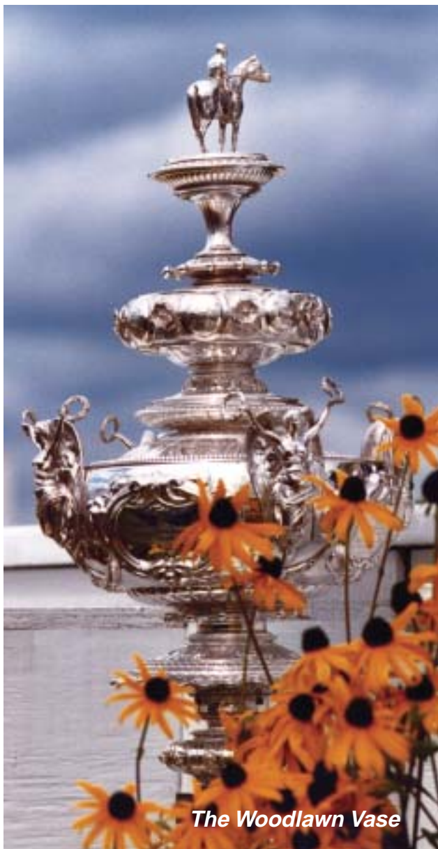
The Woodlawn Vase

“For, in the end, the businesses that are most successful are those that serve their customers effectively and efficiently. That is how the state will serve its customers, the business community. And that is how Maryland—one of the best places to live and to work in all the world—will emerge a winner, too.” MBR