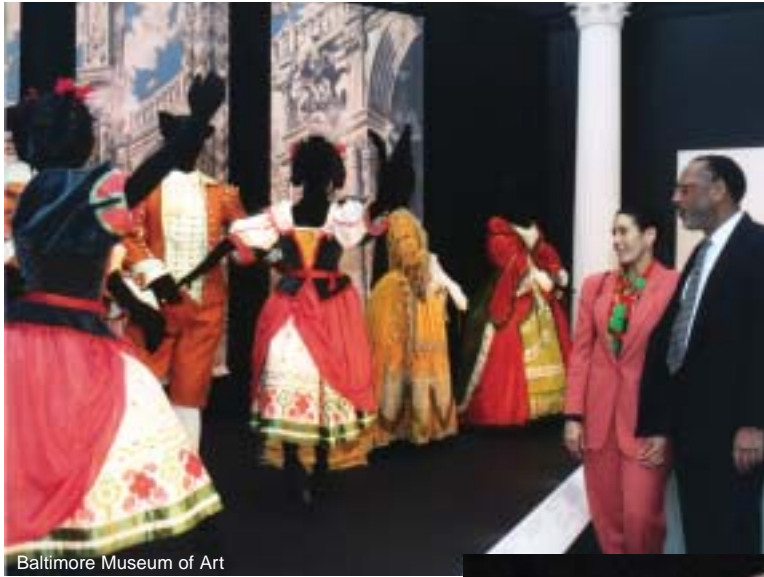
Baltimore Museum of Art