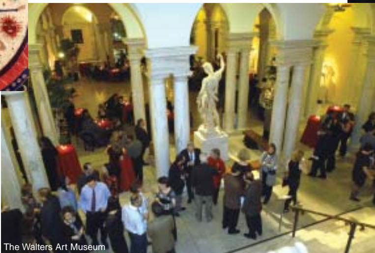
The Walters Art Museum