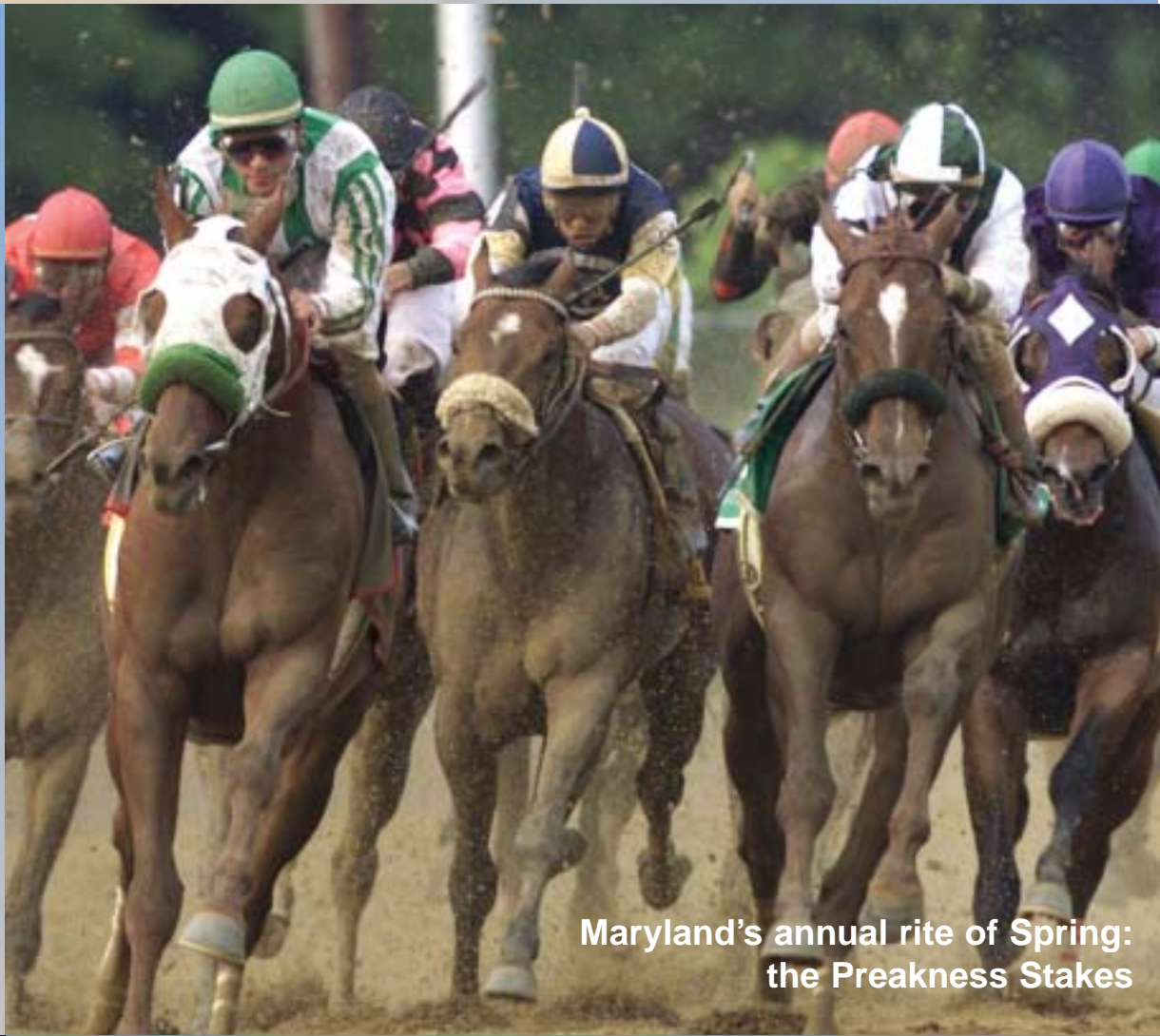
Maryland's annual rite of Spring: the Preakness Stakes